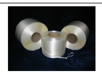
High Quality Polyester Bale Strap