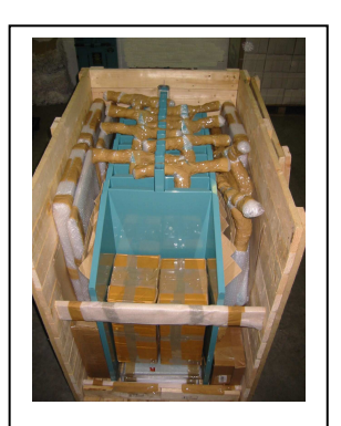
10 MiniPak's flat packed & loaded in crate.

Ceco... we ship WORLDWIDE from single machines to full container loads.