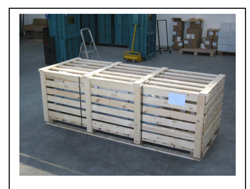
Single 75 in heat treated crate for customer in Africa.

Two 75's bolted back to back for customer in Australia.