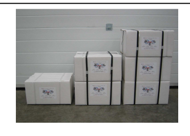
Purchase 1, 2, 3 or more boxes